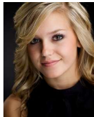
1 Photo 8x10