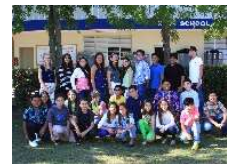
Class Picture 8x10