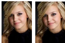
2 Photos 5x7