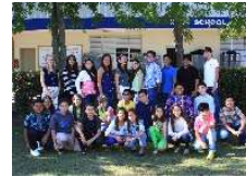
Class Picture 8x10