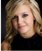
1 Photo 8x10